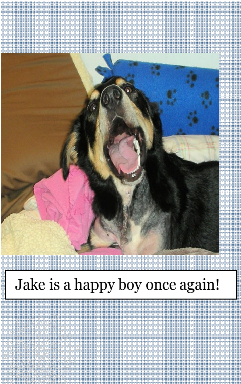
Jake is a happy boy once again!

Jake is Shepherd mix pup that jumped out of the car window while his Dad was driving, and was struck by a passing vehicle. He had to have two surgeries before starting canine rehab. Initially Jake was unable to hold his head up and had to be hand fed. Jake's Dad required financial assistance after Jake's unplanned medical bills mounted. Jake boarded at the rehab facility for a month and had numerous daily treatments. Today, he walks a little "wiggly" but is happy and healthy. Dad was able to get