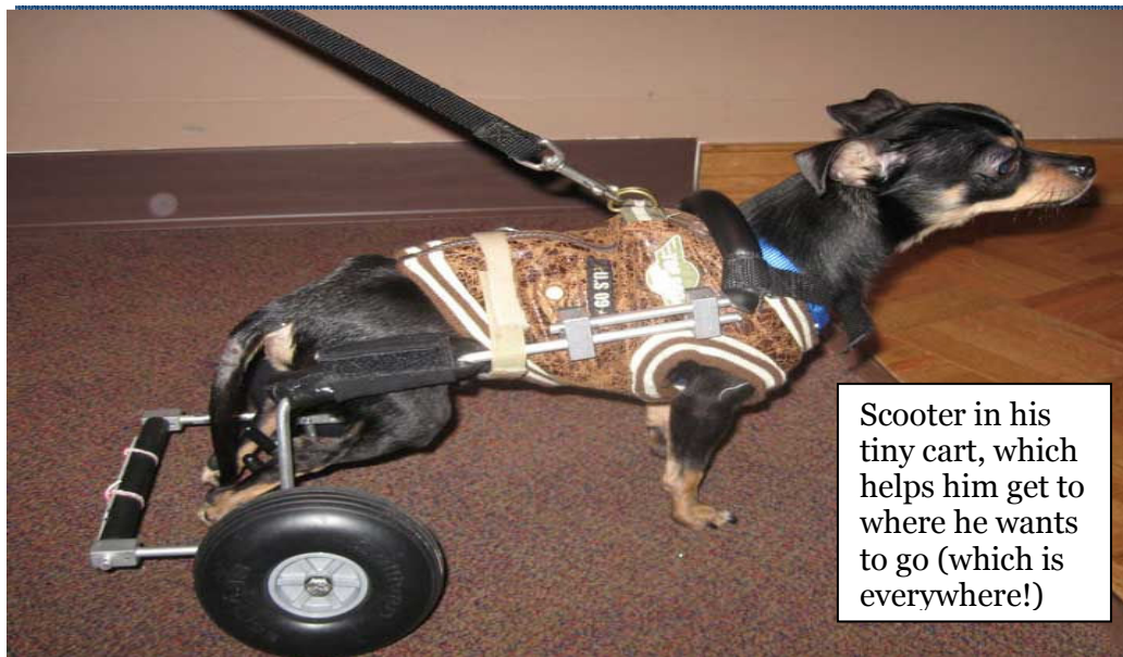
Scooter in his tiny cart, which helps him get to where he wants to go (which is everywhere!)