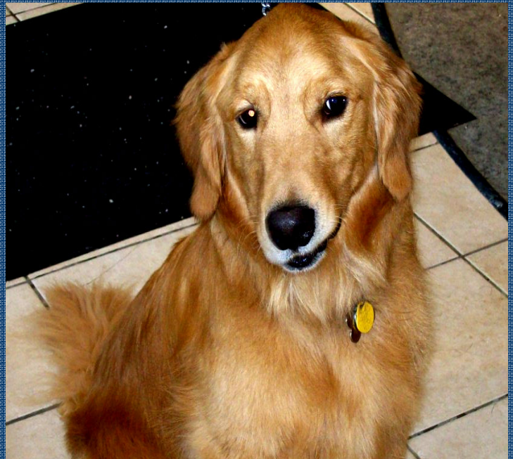
Ace is back in action after rehab!

Ace started his amazing road to recovery at the rehab clinic by getting chiropractic and acupuncture therapy, massages and passive range of motion. He relearned to walk by conditioning in the hydrotherapy pool. Once able to walk on his own, strengthening exercises were the key to his well-being.